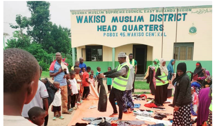
Students giving out clothes to the Muslim community in Wakiso district