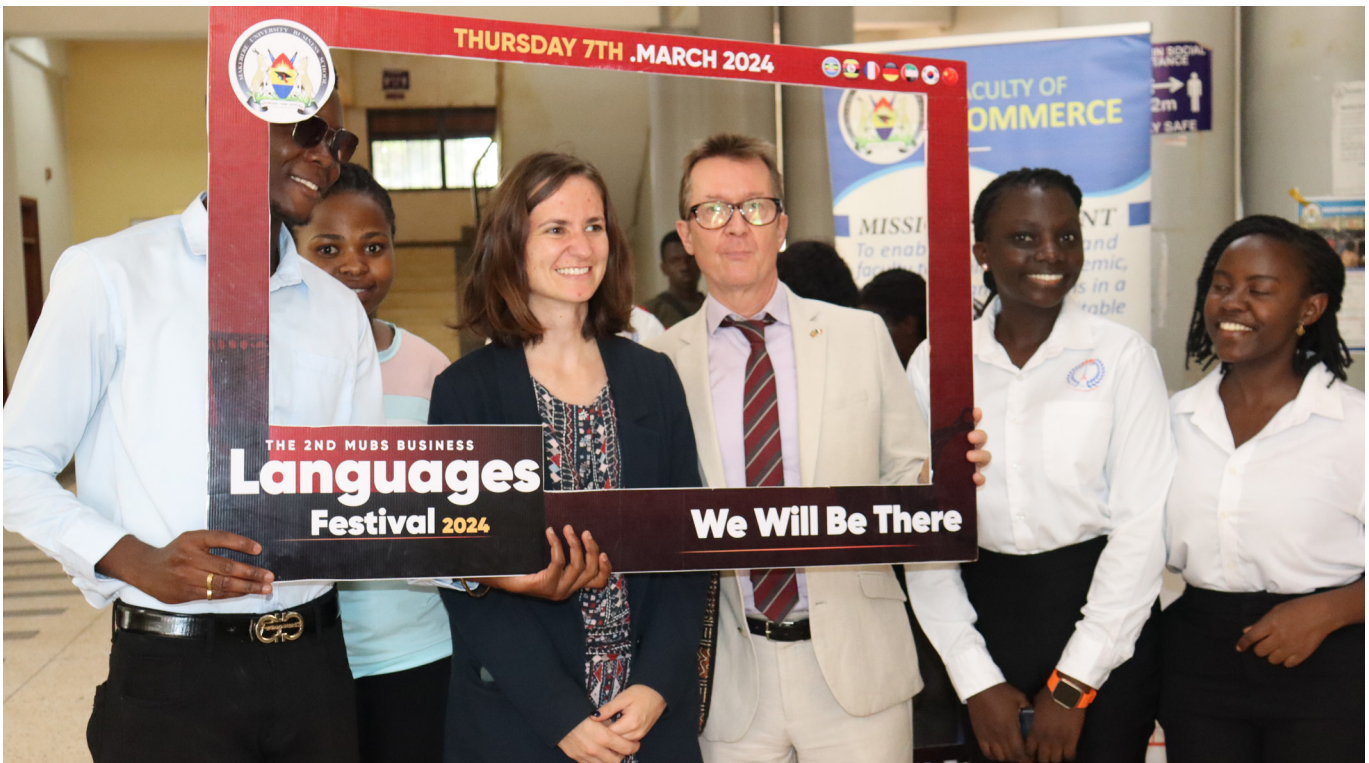
The French students and the visitors from the French Embassy during the launch of the French corner at MUBS Main Library

The Department of Business Languages under the Faculty of Tourism, Hospitality and Languages invites all students for the second Business Language Festival 2024 which is slated to take place on March 7, 2024 at MUBS Main Campus Nakawa. With the growing evolution of today's global