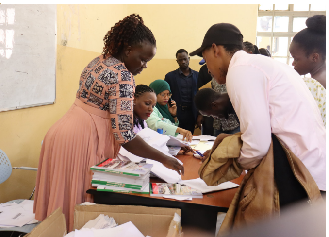
Students picking up their graduation gowns and other materials like booklets and invitation cards to get ready for graduation