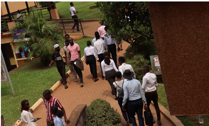
Students reported back for second semester on 15 th January, 2024